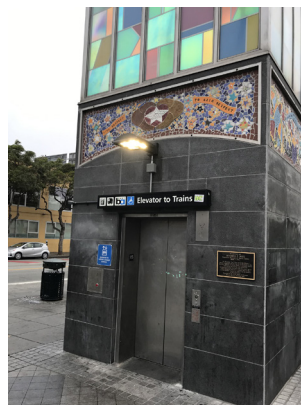
16th Street Mission - new light

In addition and because many of the lights were installed in front of elevator doors, much of the work had to be done at night when no trains were typically running. Furthermore, two of the lights were within 6 feet of the trackway and as such required special attention. This included the 40 hour training of three Sustainable Group personnel to be qualified as "Watchpersons." Several pieces of specialty equipment were also utilized during the course of the work to include mobile vertical lifts, material lifts,