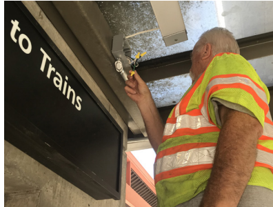
New light installation

Sustainable Group is a Service Disabled Veteran Owned Small Business Corporation.