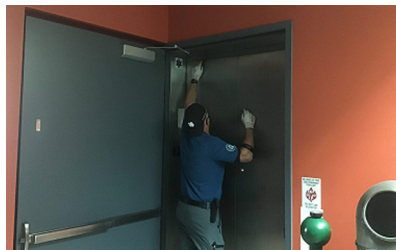
Emergency opening of elevator doors

The U.S. Coast Guard Base Alameda Building 55 elevator suffered a significant malfunction in late 2019 that trapped several Coast Guard personnel in the elevator for multiple hours. The existing elevator operated with proprietary software and unfortunately, that company reportedly did not respond to correct this situation. Eventually, a local elevator service company was able to open the doors and free the personnel. This project required a complete inspection of the existing elevator as well as recommendations for repair/replacement. Sustainable Group teamed with Enpro Elevator Services to perform the inspection and to complete the approved recommendation to replace the proprietary controls with open-source controls. Enpro in turn removed the existing controls system and replaced it with an MCE system. This replacement required several programming iterations to ensure the remaining elevator cab components integrated with the new system. Once the new controls were in place however, the elevator still suffered an intermittent "loss of power" code every three to four months, but would return to normal function within a few minutes. Sustainable Group and Enpro technicians diligently responded after every incident until the issue was finally resolved even though the last couple of incidents occurred outside the warranty period. The elevator is now fully operational without any further reported incidents.