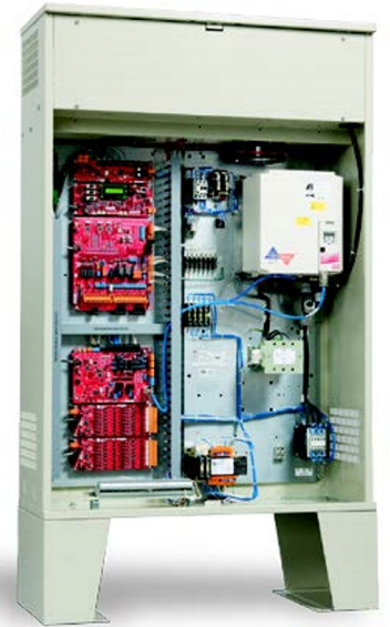
MCE elevator controls

For more information, call us at 925-899-9721 , or email info@sustainable-group.com .