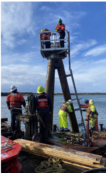
Light 13 ladder/light installation