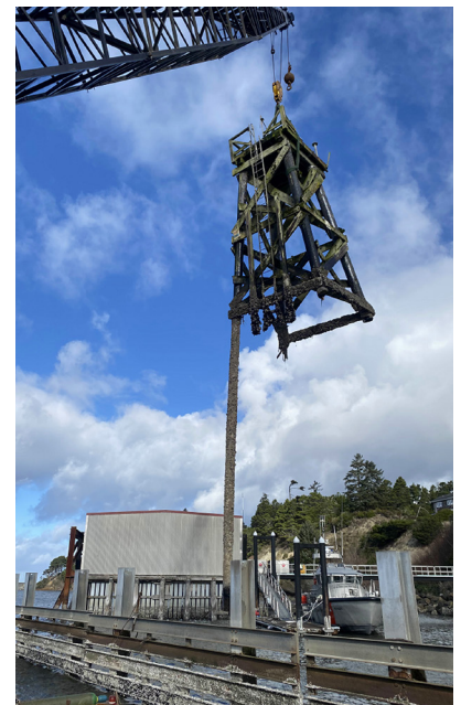
Light 13 structure removal