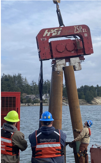
Vibratory pile driving operations